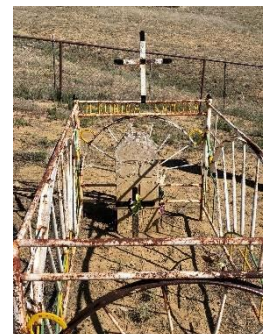
Juanita cemetery gravesite

We then drove a short distance to the Pagosa Junction/Gato Cemetery. Ruth explained the process for documenting and identifying the burial sites. She also explained how the land was set aside around 1890 to 1900 for the cemeteries with infrequent burials continuing today. From Pagosa Junction we drove to Juanita. Just before arriving at Juanita we stopped at an overlook to see the double railroad