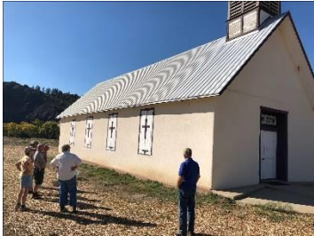
St. James Mission