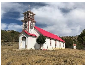
St. John's Church

We headed east on Highway 160 to the Cat Creek Junction turn-off and then south to Pagosa Junction. Only St. John's Catholic Church, a few abandoned structures and remnants from the Denver & Rio Grande Railroad remain in the settlement. Ruth had arranged for us to meet Chris Chavez at the Church. We were thrilled to tour the well-preserved 100+ year old church. Even though there has been some vandalism, the church is beautifully preserved, especially the stained-glass windows. The church is still used for special religious celebrations.